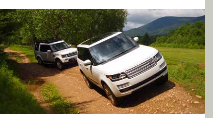
*All bookings must be secured with a credit card. Applicable taxes may apply. All pookings must be secured with a credit card. Applicable taxes may apply. Drivers must be 21 years of age or older and have a valid driver's license. A signed release is required for all attendees. Space is limited. Prices and course content are subject to change without notice. "Price may vary by location. 120% gratuity applied to all group bookings. © 2017 Jaguar Land Rover North America, LLC